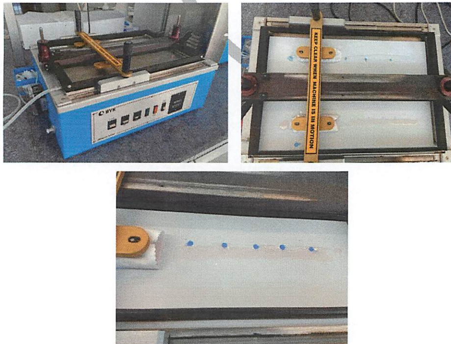
Figure 1: Test set-up. Wipe-testing device PB 5000 BYK and Leneta plates coated with Liquid Guard.

Cleaning simulation with water and cleaning agent using a wipe-testing device (PB 5000 BYK).